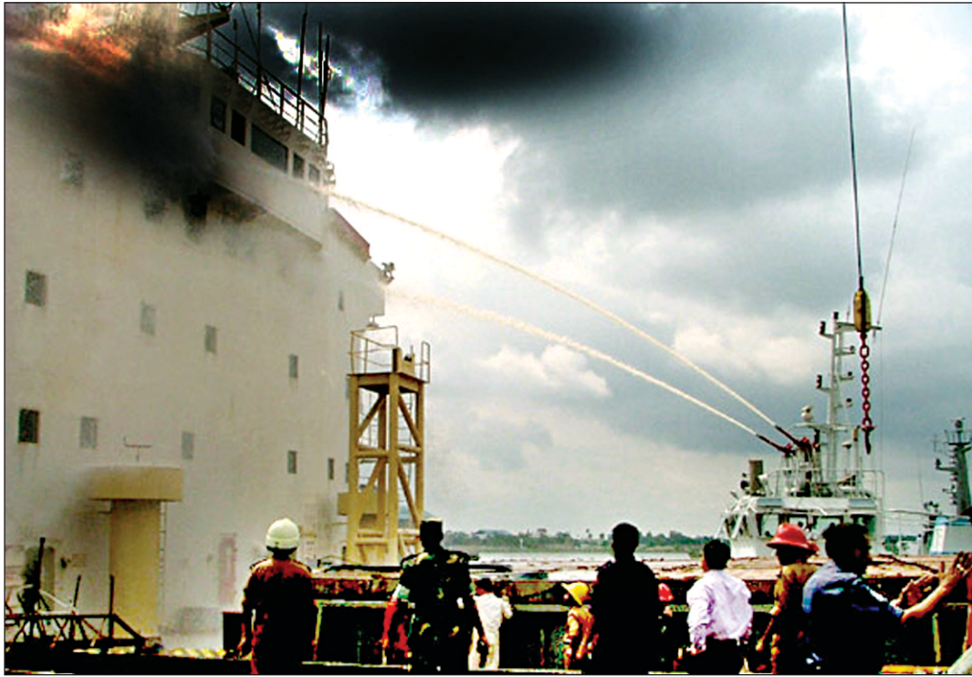
Firefighters trying to tame the blaze at Chinese cargo ship MV Jin Cheng in Chittagong Port yesterday.

SPORTS REPORTER Mahmudullah Riyad was the only fresh inclusion in Bangladesh's squad to tour Sri Lanka in June-July for three Tests and as many one-day internationals. The Bangladesh Cricket Board (BCB) yesterday named a 15-member Test squad and five additional players who would join the one-day series. The 21-year old off-spinning all-rounder Riyad, who hails from Mymensingh, was included in the additional list along with Aftab Ahmed, Tamim Iqbal, Tushar Imran and Forhad Reza, who will join the team in the island on completion of the Test series. The selectors, however, will wait till the Test series to decide who would return. Former captain Habibul Bashar, who stepped down as one-day captain but wished to continue as a player, retained his place in the Test side. Two changes have been made from the previous Test squad against India with middle-order batsman Tushar and left-arm spinner Enamul Haque dropped to make way for wicket-keeper cum batsman Mushfiqur Rahim and Abdur Razzak. SEE PAGE 15 COL 5