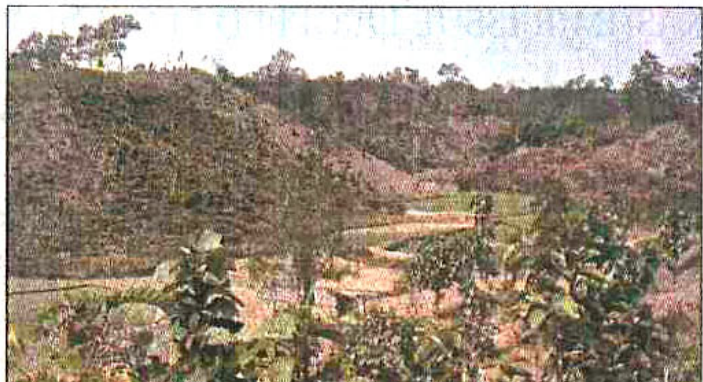
A part of Jugalchhari Reserved Forest in Khagrachhari hill district left without trees due to plunder by a section of forest officials for long.

A total of 2,415 acres of the reserved forest, which was supposed to grow into a lush habitat