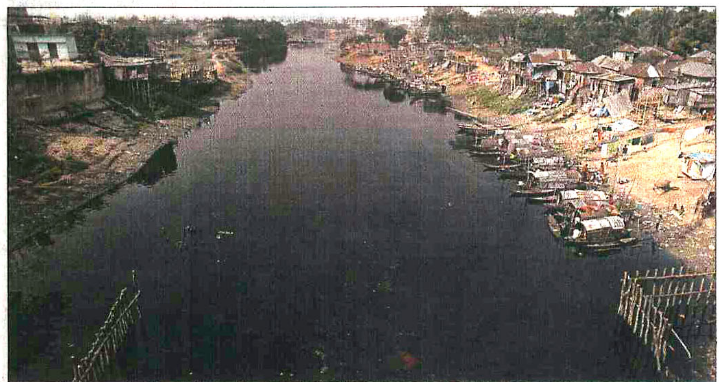
Water of the Turag near the capital turns pitch-black due to dumping of factory wastes. The photo was taken yesterday ahead of World Environment Day today.