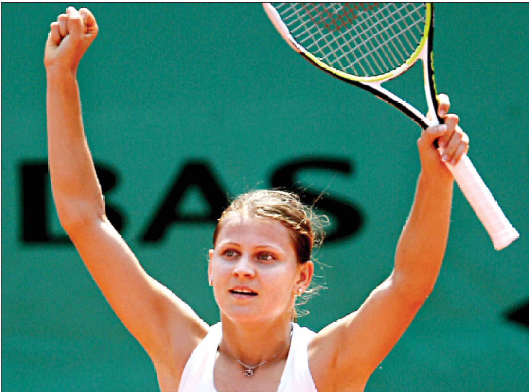
Lucie Safarova of the Czech Republic celebrates her shock victory over French veteran Amelie Mauresmo after French Open third round match at Roland Garros on Saturday. Safarova won the match 6-3, 7-6.

Meanwhile, the board has decided to increase the salary of the contracted players by 20 per cent and for the first time, brought the A team and under-19 players under the board's payroll. A-team players will get fifty per cent of what the national members receive while under-19 players will receive twenty-five per cent.