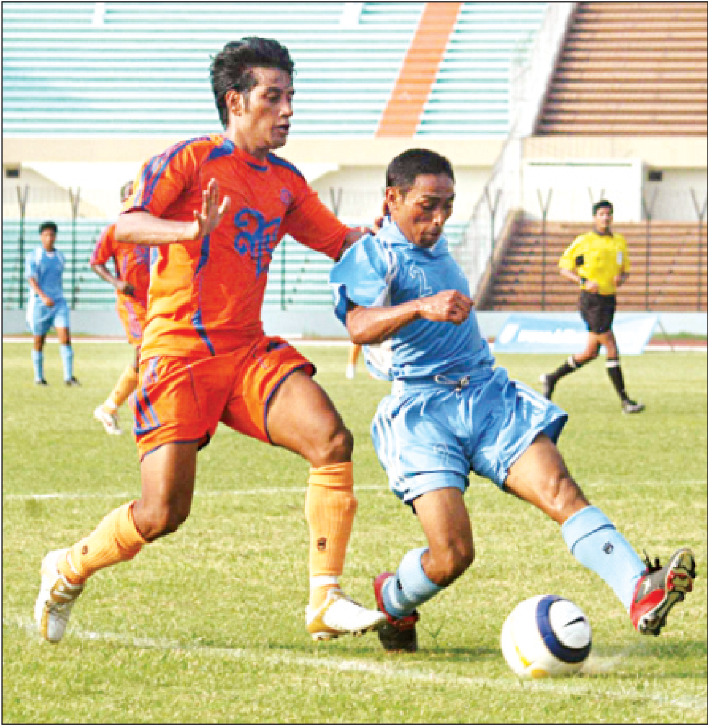
Action from yesterday's match of the B. League between Brothers Union and Farashganj at the Bangabandhu National Stadium.

On 11 points, Khulna Abahani edged Farashganj by virtue of a better goal difference while Chittagong Abahani remained just above the base of the table with ten points.