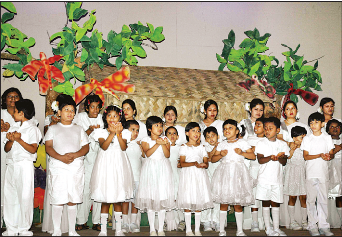
Students and teachers of Kanan perform at the programme

AWF also held a two-day fair, featuring handicrafts by the autistic children, starting from yesterday at the organisation's school at Shyamoli.