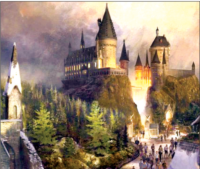
"The Wizarding World of Harry Potter" is set to open in 2009 at Universal Orlando Resort in Florida