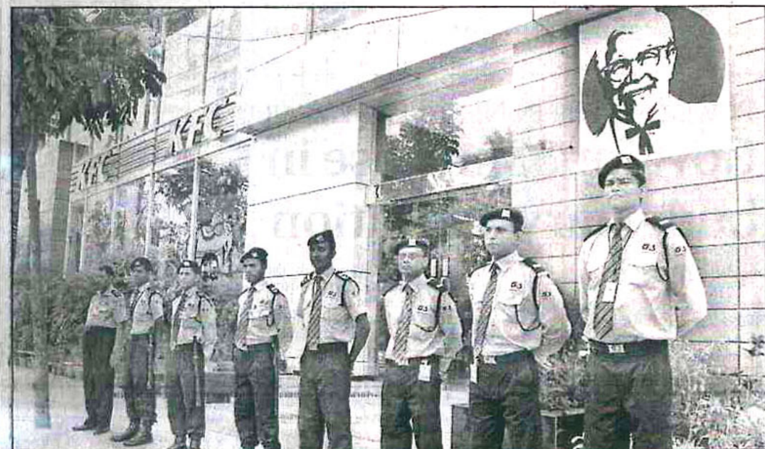
Officials of G4S Bangladesh, a security service provider, stand guard in front of the KFC at Gulshan in the city yesterday. They acted as security guards from 8:00am to 12:00 noon to express solidarity with the G4S guards as part of a programme called 'Lead by Example'.

Various programmes have been taken in Dhaka and Sylhet, marking the day.