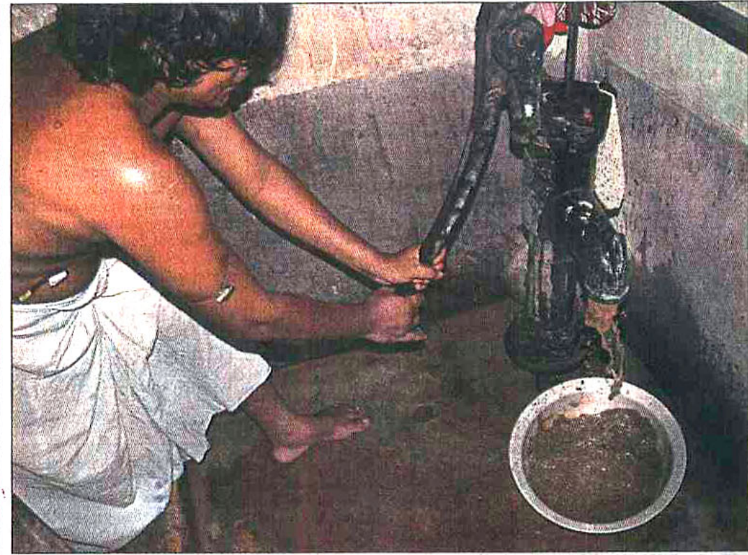
The tube-well hooked up to a Wasa line releases filthy and stinky water. The photo was taken from Nazimuddin Road in Old Dhaka yesterday.