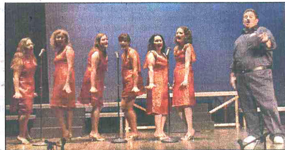
Actors of Dhaka Stage in a scene from Working

With twelve solo performances, the show had a professional look and was thoroughly entertaining.