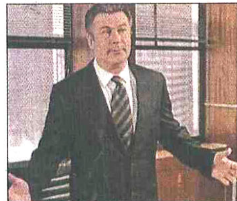
30 Rock On Star World at 9:30pm TV Series Cast: Alec Baldwin, Tina Fey

All programmes are in local time. The Daily Star will not be responsible for any change in the programme.