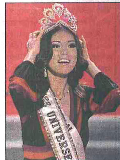
An ecstatic Riyo Mori after being crowned