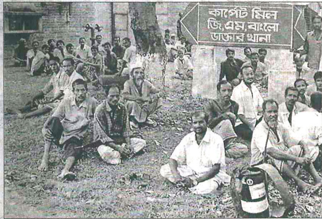
Workers of Amin Jute Mills in Chittagong lazing on the compound after stopping work yesterday to press payment of arrears salary.

He submitted a report to the government recommending partial operation of the laid-off jute mills, sources said earlier.