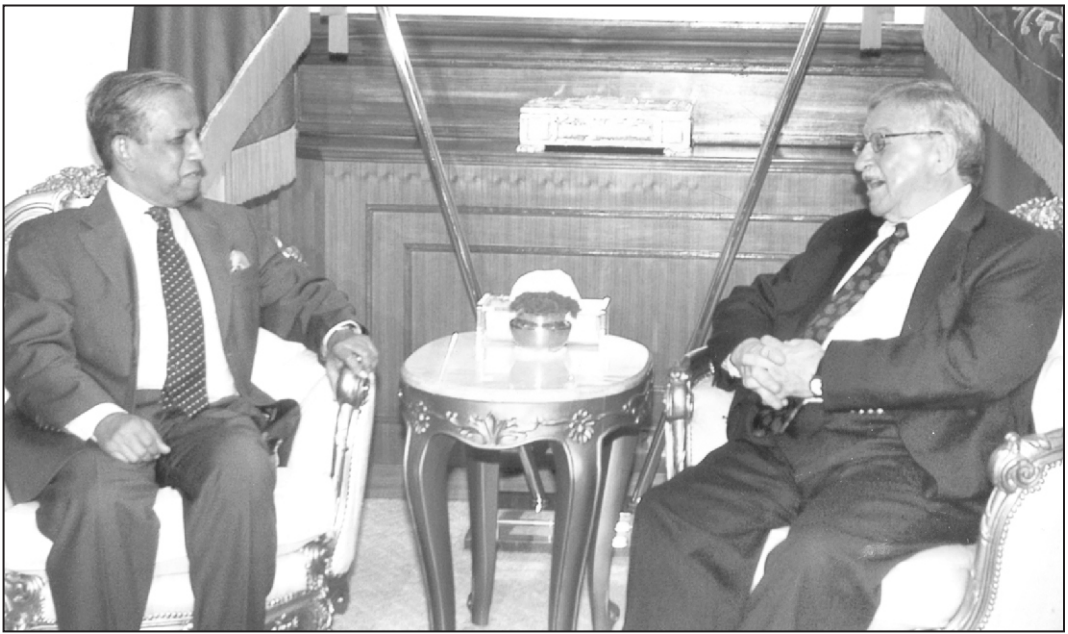
Former US Ambassador William B Milam calls on Chief Adviser Fakhruddin Ahmed at his office in the city yesterday.

It was the second meeting of the joint committee this year. The previous meeting was held last month.