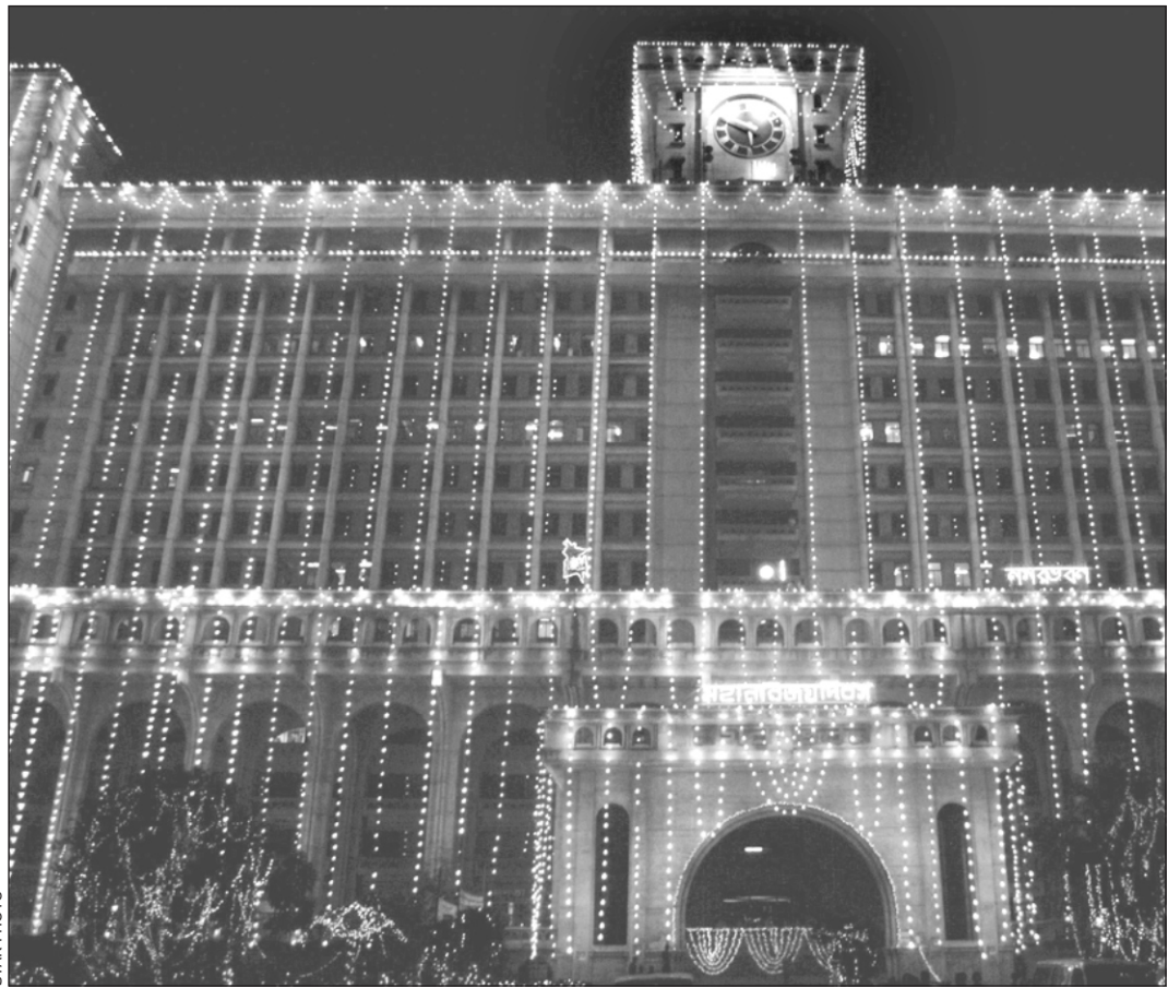
An illuminated Nagar Bhaban: Good news at last.