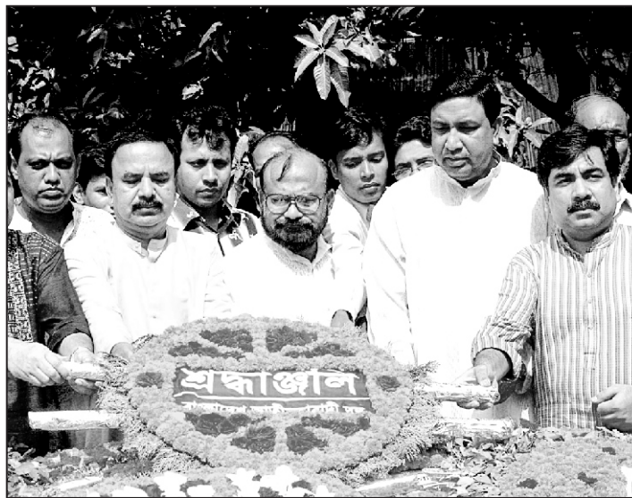
Leaders of BNP, left, and Awami League, right, place wreaths at the grave of National Poet Kazi Nazrul Islam on Dhaka University campus yesterday, marking his 108th birth anniversary.