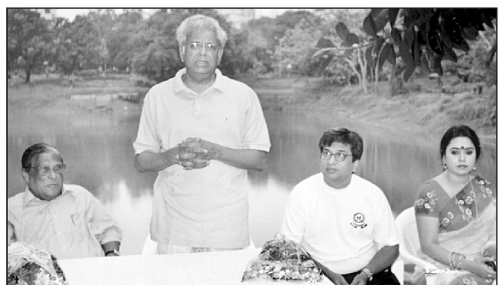
Chief Election Commissioner Dr ATM Shamsul Huda speaks at a discussion titled 'Tune of Health and Mind' at Gulshan Tank Park in the city yesterday. Sitting on his right is former adviser to the caretaker government Dr Akbar Ali Khan. Gulshan Health Club organised the discussion.