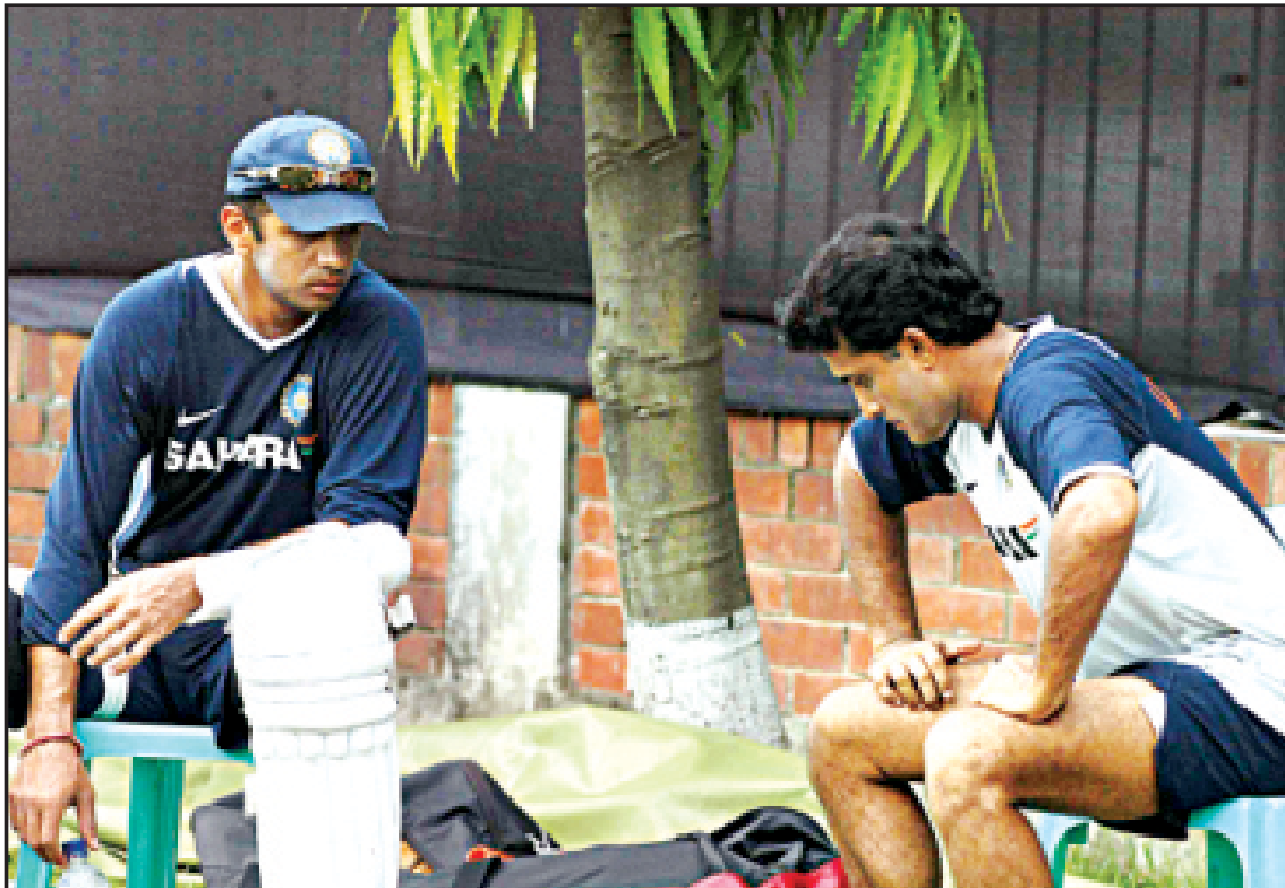
(L) India captain Rahul Dravid (L) talks with his predecessor Sourav Ganguly while (R) leg-spinner Anil Kumble (R) checks the quality of a bat as Bangladesh paceman Mashrafe Bin Mortaza looks on during their training sessions at the Sher-e-Bangla National Stadium in Mirpur yesterday.