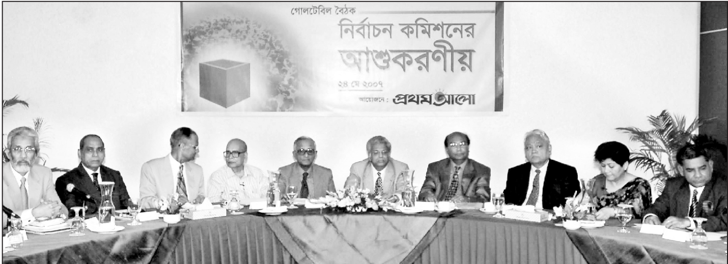
The Prothom Alo organised a roundtable titled 'Immediate Action Plan for Election Commission' at Hotel Sheraton in the city yesterday. (Story on Page 20)