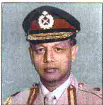
Lt Gen Moeen U Ahmed

He said he wants elections and restoration of an elected government as early as possible. If the army wanted to take power, they could do it during the chaotic