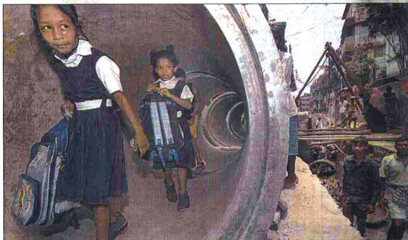
Kids on their way home from school yesterday walk through sewerage pipes kept on a road in the city's East Basabo area as Dhaka Wasa dug the road for laying the pipes.