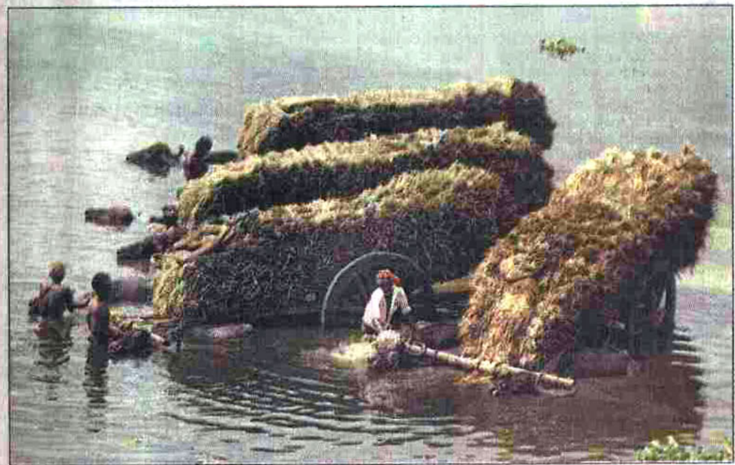
Buffalo carts carrying paddy to peasants' houses is a common sight in rural Bangladesh. This picture shows such loaded carts in a water body as buffaloes like to have dips in scorching summer heat.