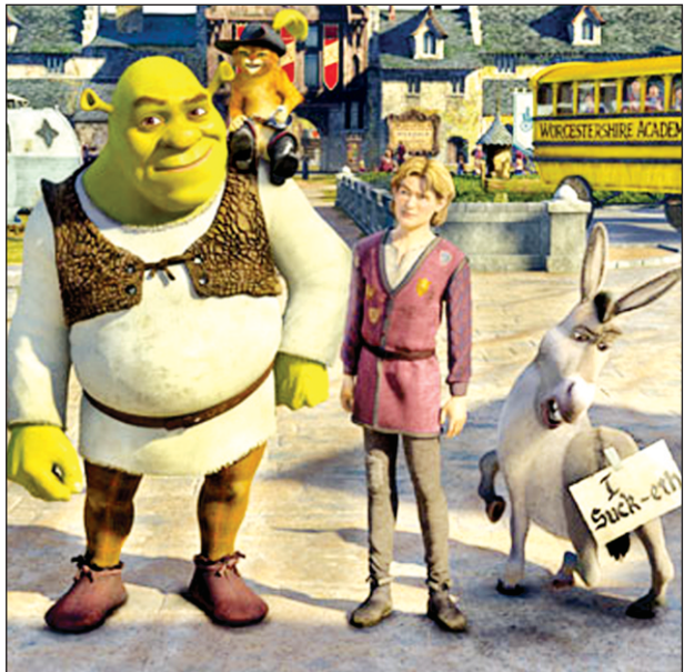
Shrek (voiced by Mike Myers), Puss-in-Boots (voiced by Antonio Banderas), Artie (voiced by Justin Timberlake), and Donkey (voiced by Eddie Murphy) in Shrek the Third

All programmes are in local time. The Daily Star will not be responsible for any change in the programme.