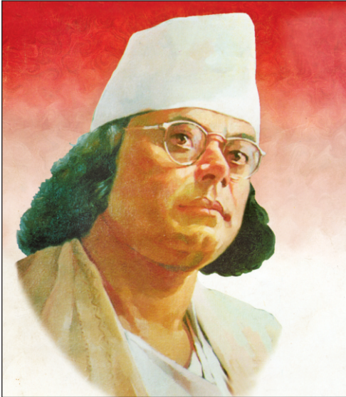
Nazrul songs, recitation, discussion and display of books. Several personal items of Nazrul will also be on display, says a press release.