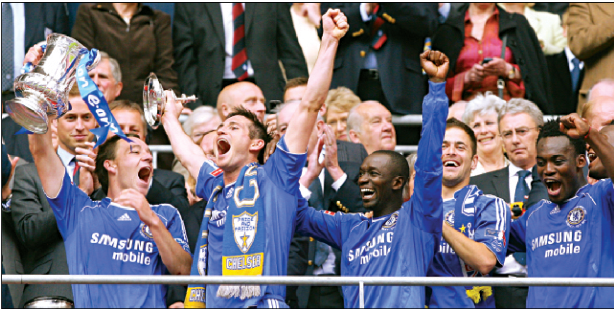
Chelsea stars (from L-R) John Terry, Frank Lampard, Claude Makelele, Joe Cole, Michael Essien and John Obi Mikel celebrate with the FA Cup Trophy which they claimed after beating Manchester United 1-0 at the new Wembley Stadium in London on Saturday.