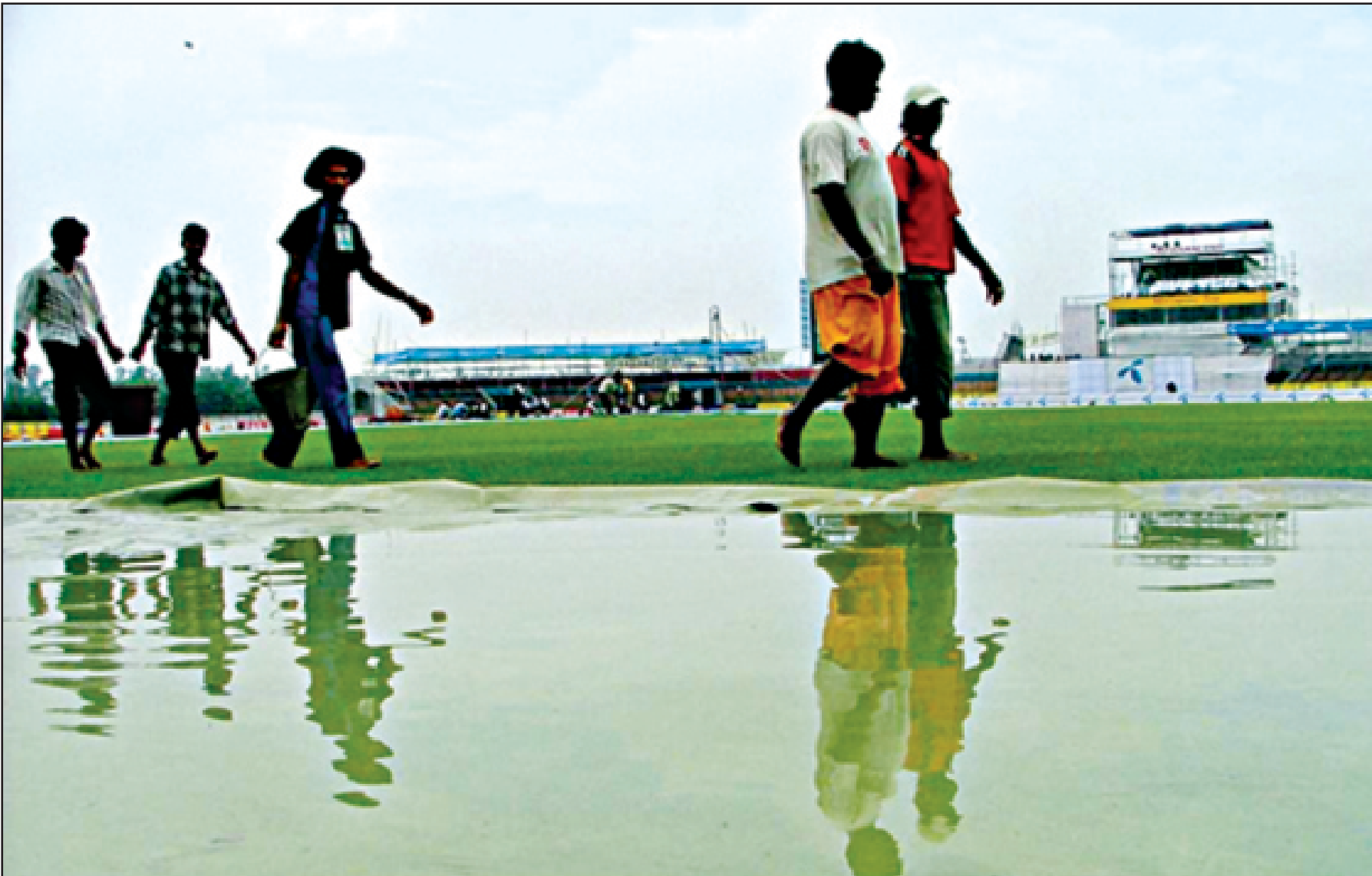
SWIM OR SPIN? Groundsmen walk past a puddle on top of the covers after play was abandoned on the third day of the first Test between Bangladesh and India at the Chittagong Divisional Stadium yesterday.

On the other hand, Tushar Imran has returned to Dhaka on Saturday and hopefully he will be available for the final Test starting from May 25 at the Sher-e-Bangla Stadium in Mirpur.