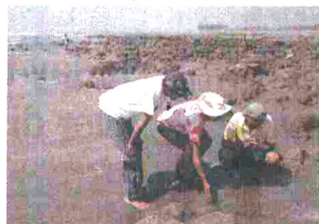
Wonder of Coral