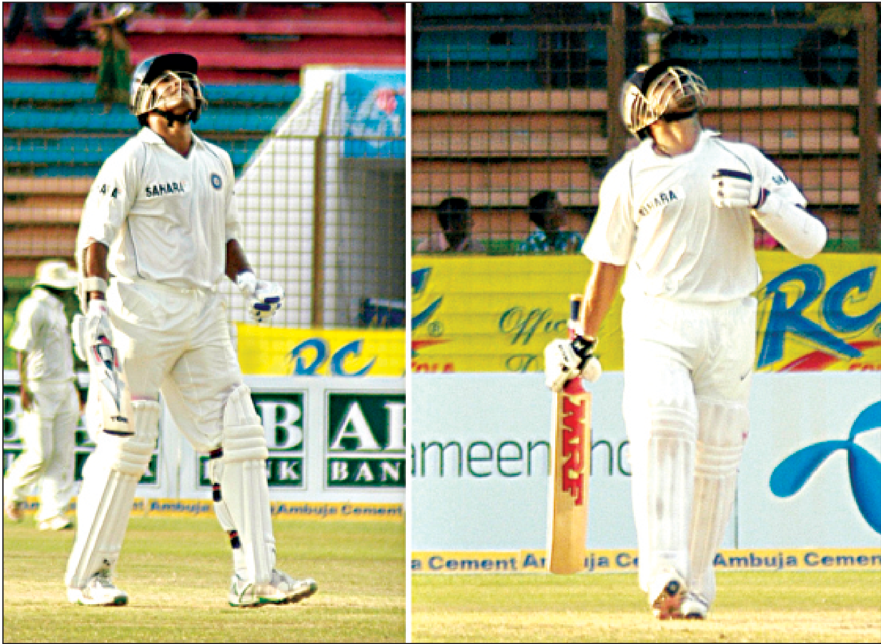
THANKING THE HEAVENS: Indian stalwarts Sourav Ganguly (L) and Sachin Tendulkar look skywards after reaching their hundreds during the second day's play in the first Test against Bangladesh at the Chittagong Divisional Stadium yesterday.