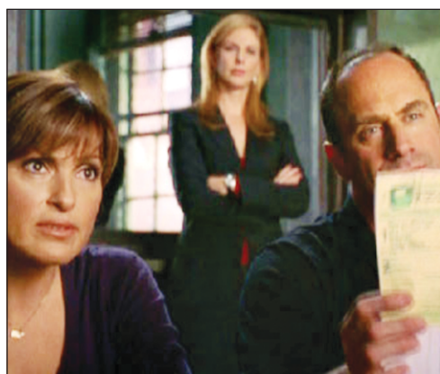
LAW & ORDER: S.V.U. On Star World at 10:30pm TV Series Cast: Mariska Hargitay, Christopher Meloni

All programmes are in local time. The Daily Star will not be responsible for any change in the programme.