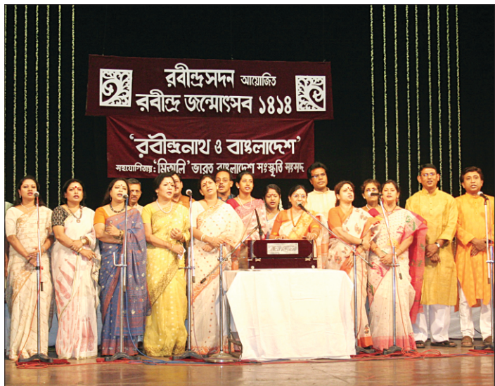
Bangladeshi artistes and members of Mitali-Bharat-Bangladesh Shanskritik Sangsad present a song at Rabindrasadan