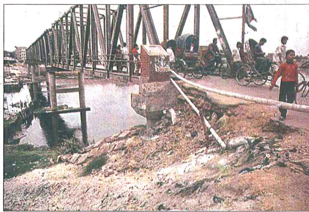
This steel bridge connecting the capital with suburb on Kamrangirchar on the other side of the Buriganga River is now in a vulnerable condition as the ground holding the pillars has loosened.