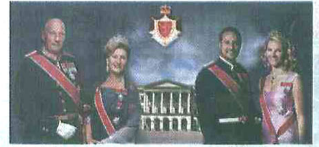
The Norwegian Royal Family