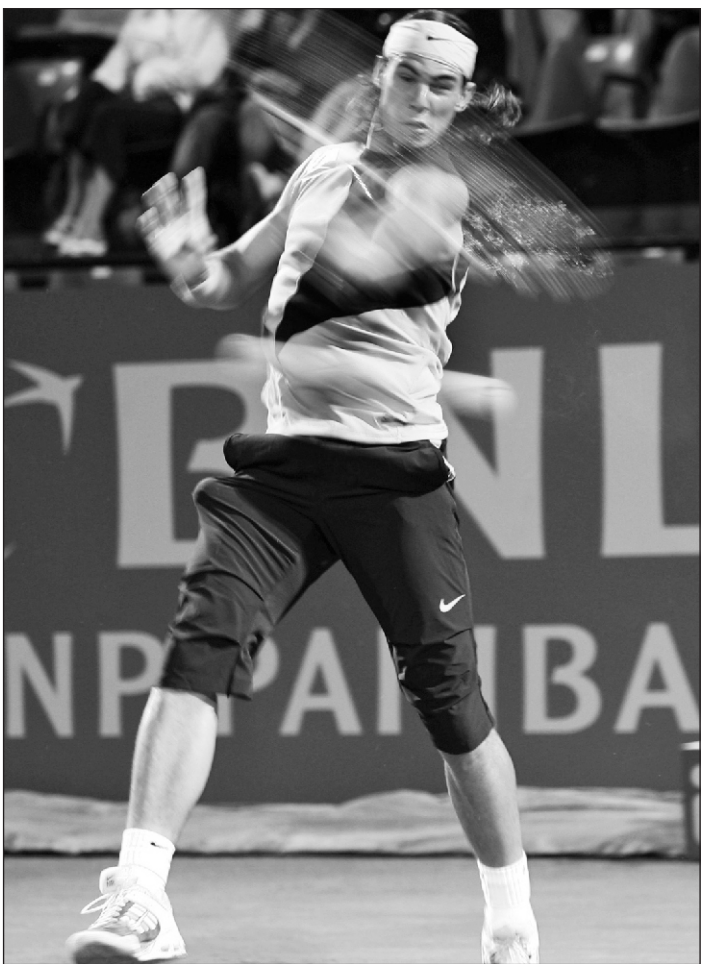
Spanish star Rafael Nadal plays a forehand return to Russian Mikhail Youzhny at the Rome's Italian Open on Thursday. Nadal won 6-2, 6-2.

(Kick-off times in GMT) Saturday Real Madrid v Espanyol (1800), Sevilla v Recreativo Huelva (2100) Sunday Athletic Bilbao v Deportivo La Coruna (1500), Celta Vigo v Levante (1500), Getafe v Atletico Madrid (1500), Gimnastic Tarragona v Real Sociedad (1500), Osasuna v Villarreal (1500), Racing Santander v Real Mallorca (1500), Barcelona v Real Betis (1700), Valencia v Real Zaragoza (1900)