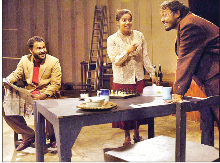
A scene from the play

distinct air of the bogus about them, as if they were parodying their respective 'Jewishness' and 'Irishness'. It becomes clear that they have come in pursuit of Stanley, to wreak vengeance upon him for a past misdemeanour, or to reclaim him for a shadowy organisation that they represent.