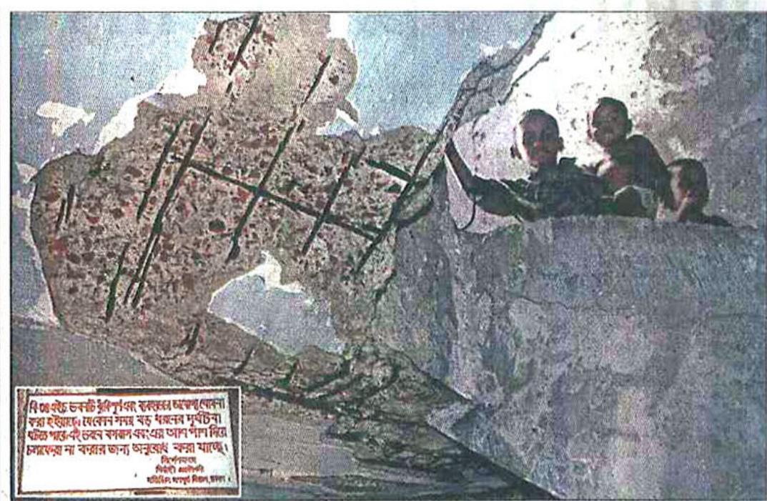
With cracks and plasters fallen off, the stairs of a Motijheel AGB Colony building in the capital remain horribly risky while about a hundred families dwell in two dilapidated buildings, turning a deaf ear to the authorities' warning (inset).