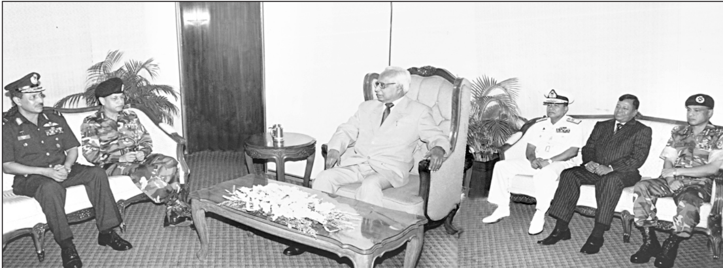
President and supreme commander of the Armed Forces Iajuddin Ahmed attended his office at the Armed Forces Division in Dhaka Cantonment yesterday.

During their raid in the Nandabala area of the forest, the criminals opened fire on them, prompting the elite forces to retaliate. However, the miscreants were forced to flee away under severe attack.