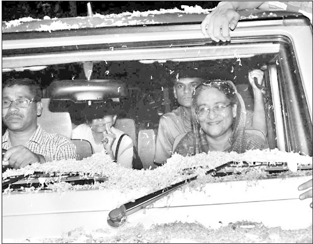
Showered with petals, Awami League President Sheikh Hasina arrives at her Sudha Sadan residence from Zia International Airport in the city yesterday. (Left) The AL chief places a wreath at the portrait of Bangabandhu Sheikh Mujibur Rahman at Bangabandhu Memorial Museum in Dhanmondi on her return from abroad.