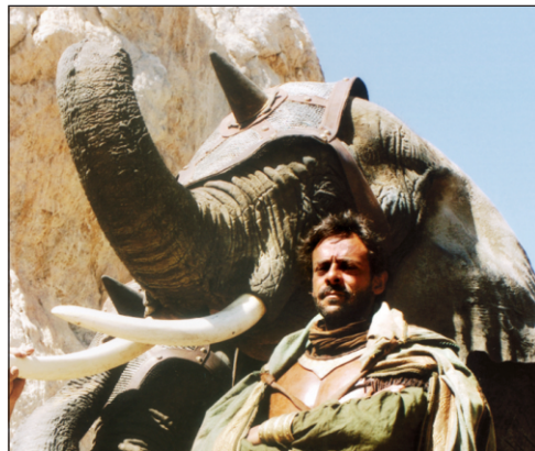
Hannibal On Discovery Channel at 8:30pm Story of general Hannibal who took on the might of Rome

All programmes are in local time. The Daily Star will not be responsible for any change in the programme.