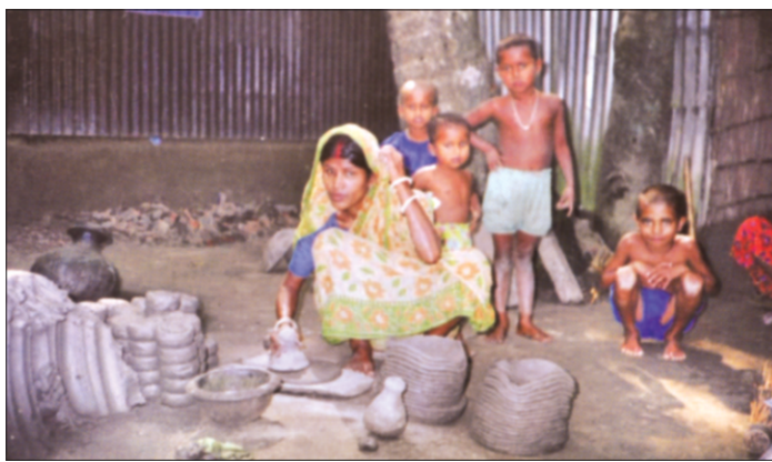
A potter's family

One of the pictures present a family of potters surrounded by pottery pieces.