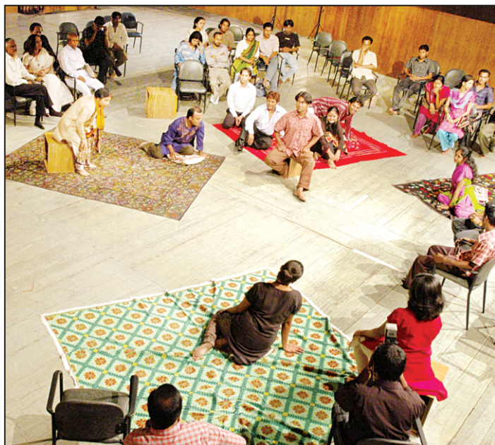
A view of the performance on the last day of the workshop