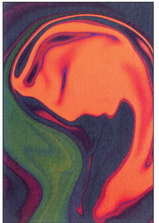
Maiemoor (top) and Against the Wind by Rabi Khan

In an image of a woman we see gold, brown and red. Colours appear as if they emerge from a fountain and at the side is a golden blossom. The subject is done with variations of red and yet it is quite clear what the artist is dealing with. The Kiss brings in an embracing couple, with their faces, limbs and bodies merging with one another. There are shapes like curls and lines within. While the woman is in shades of brown the man is in orange and red. The background is in turquoise and jade. The Two , also introduces a hovering couple. At the outset one might