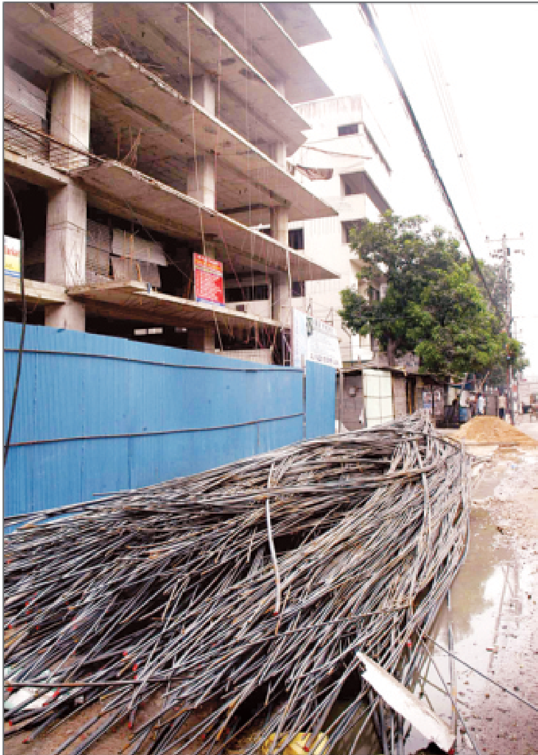
Construction materials kept on the pavement near Bijoy Nagar Water Tank in the city hinder smooth movement of pedestrians. The picture was taken yesterday.

Zaglul Ahmed urged people to donate blood voluntarily to save human life and reduce sufferings of millions of patients across the country.