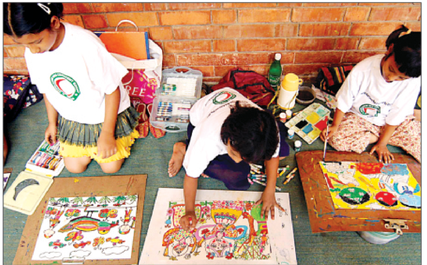
Children engrossed in drawing pictures at an art competition at the Institute of Fine Arts in the city yesterday. Bangladesh Red Crescent Society organised the competition on the occasion of the World Red Cross and Red Crescent Day 2007.

The refined adulterated lubricants were being sold to different petrol pumps at Chittagong and Dhaka, sources said.