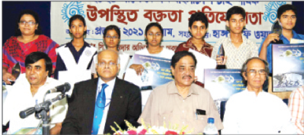
Participants of an extempore speech competition organised by Pratyasha 2021 Forum pose for photograph with the guests at RC Majumdar auditorium in the city yesterday.