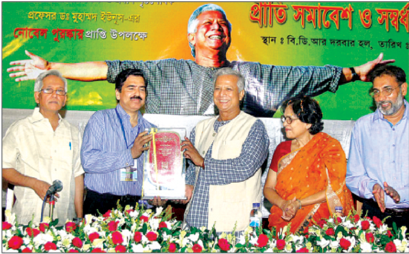
Nobel laureate Prof Muhammad Yunus receives a crest at a reception accorded to him by Chittagong University Ex-Economics Students' Association (CUEESA) at BDR Darbar Hall in the city yesterday.