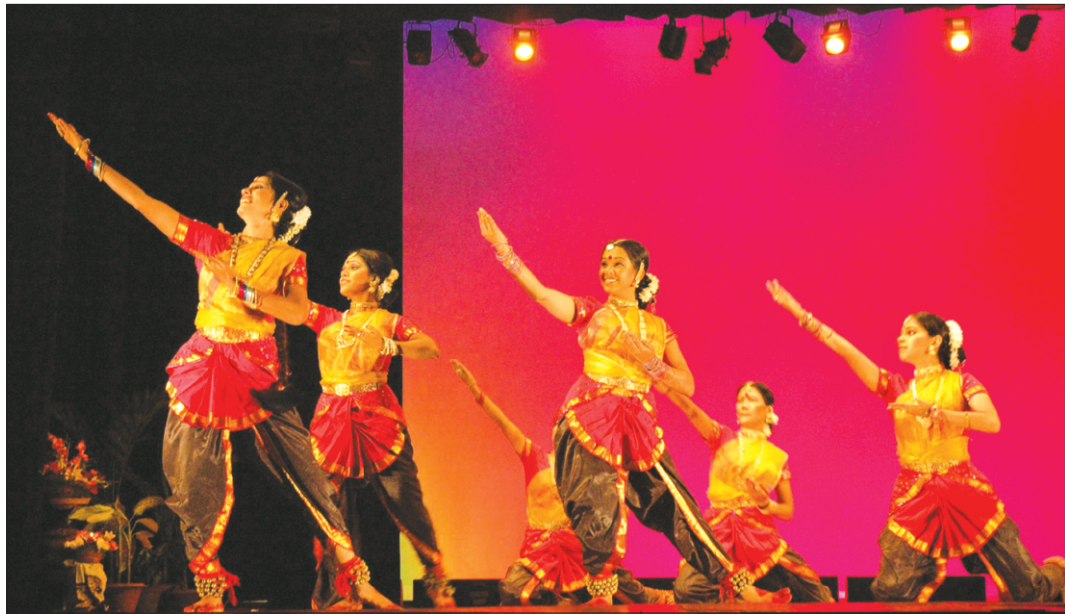
Jagaron, a dance performance by Jago Art Centre