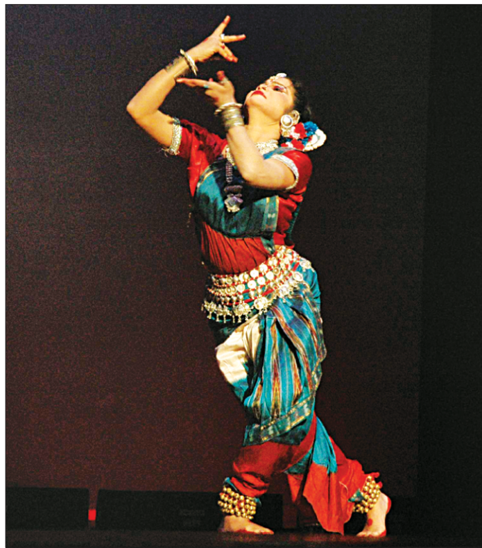
An artist of Odissi and Tagore Dance Movement Centre (Chittagong) performs at the event

The speeches were followed by dance performances. Artists of BAFA, Chhayarat Sangetayan, Jago Art Centre, Nrityalok Sanskritik Kendra, Tridhara, Odissi and Tagore Dance Movement Centre (Chittagong) and others presented performances highlighting different styles and