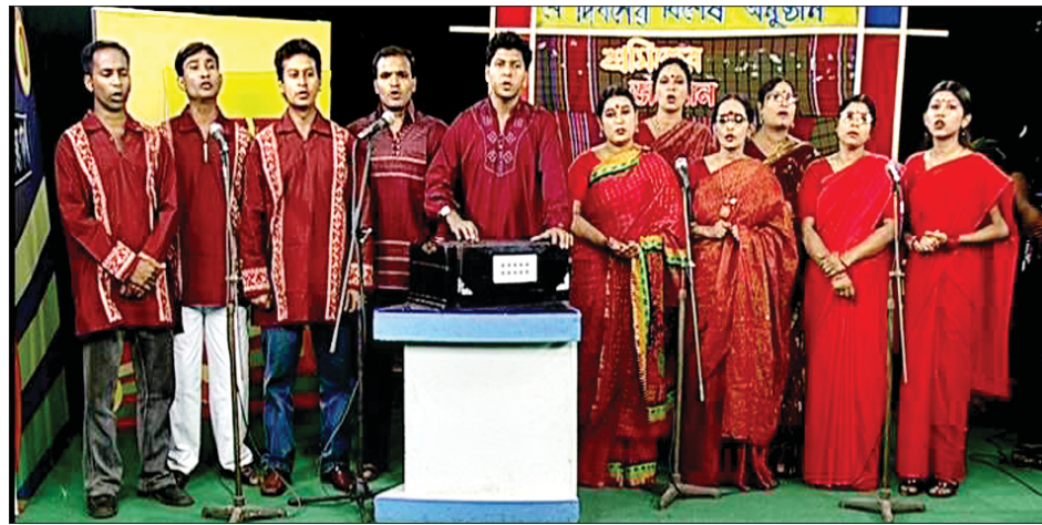
A scene from Sromiker Jayagaan