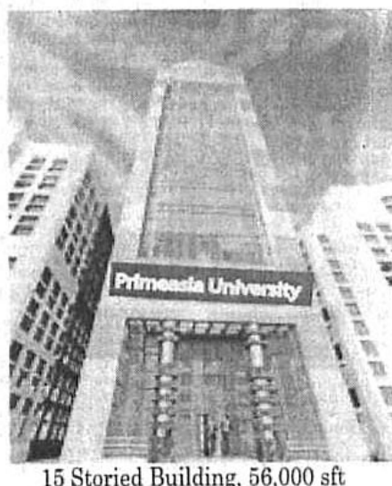
15 Storied Building, 56,000 sft

Apply online : www.primeasiaadmission.com