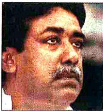
A CORRESPONDENT, N'ganj

In the first-ever verdict in a case filed by the reformed Anti-corruption Commission (ACC), a