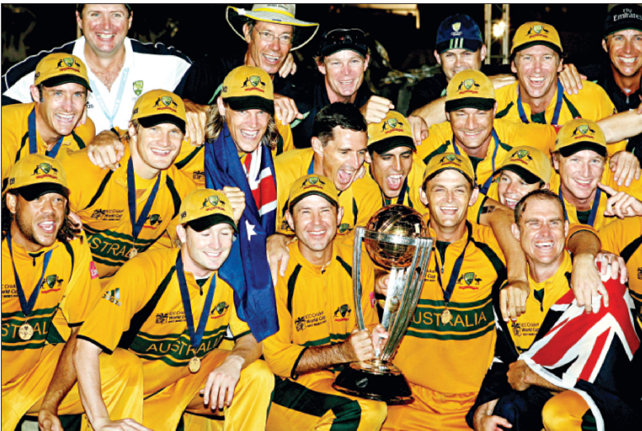
CLASS OF 2007: Australian players pose with the World Cup trophy after their victory over Sri Lanka in the final at the Kensington Oval in Bridgetown on Saturday.