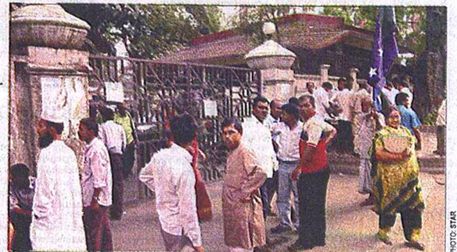
Teachers of high schools, colleges and madrasas from across the country are forced to wait in front of the closed gate of Shikha Bhaban in the capital as the authorities keep it shut until 2:00pm every working day.