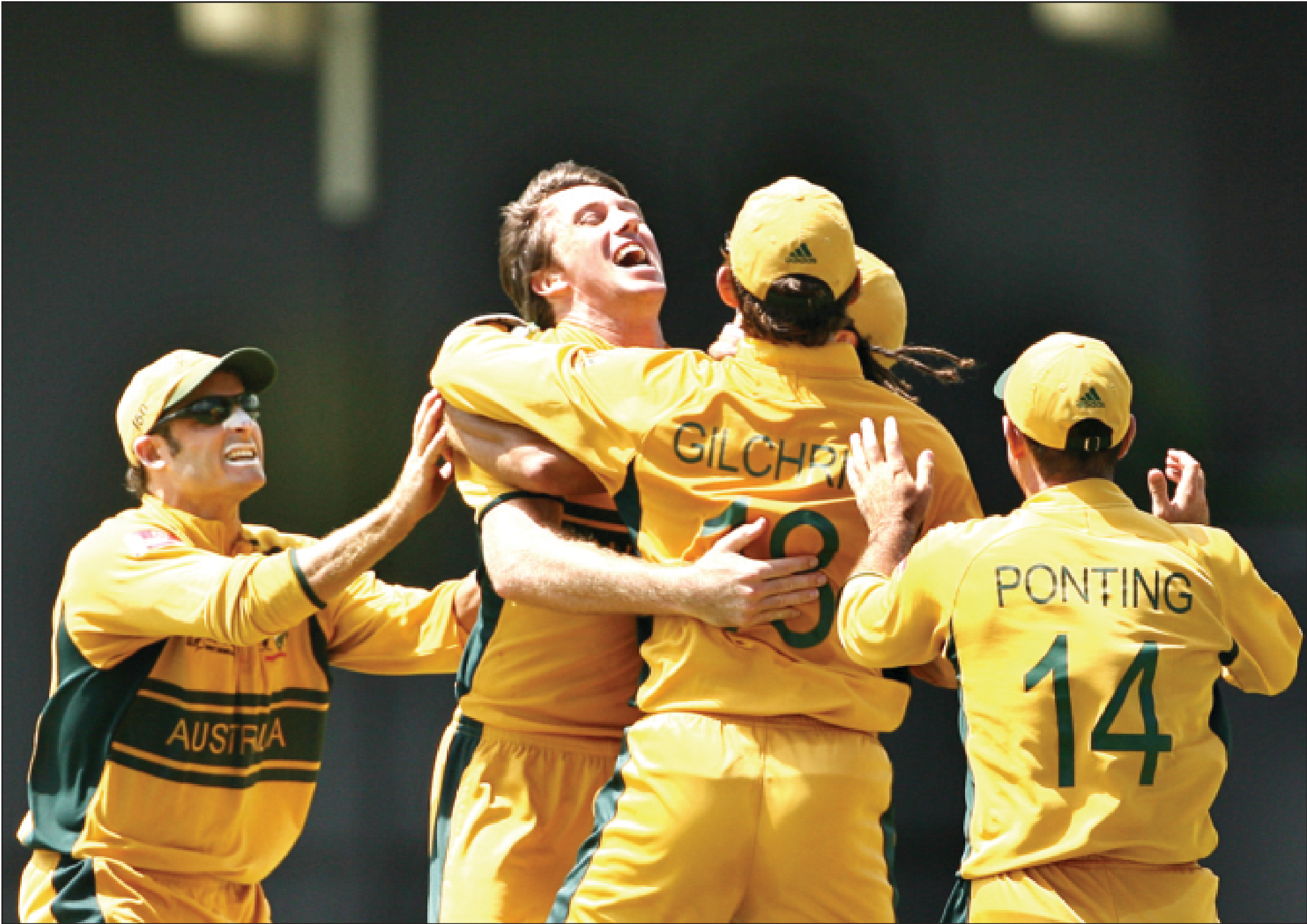
Australia paceman Glenn McGrath (2nd from L) is the toast of his teammates after taking the wicket of South Africa batsman Mark Boucher (not in the picture) during their World Cup semifinal at the Beausejour Cricket Ground in Gros Islet, St. Lucia on Wednesday.