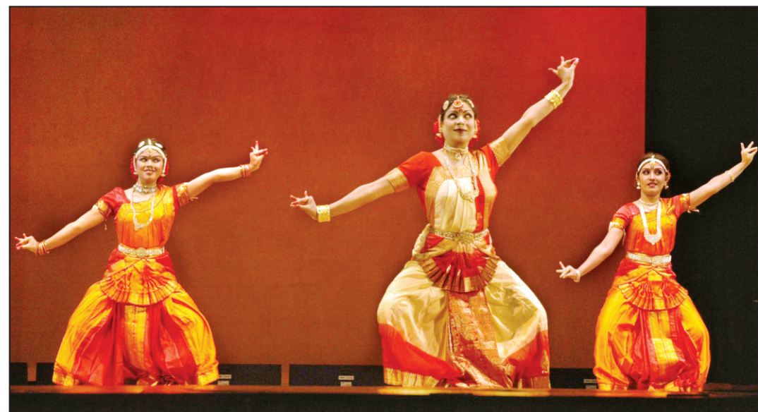
Dancers perform on the first day of the festival