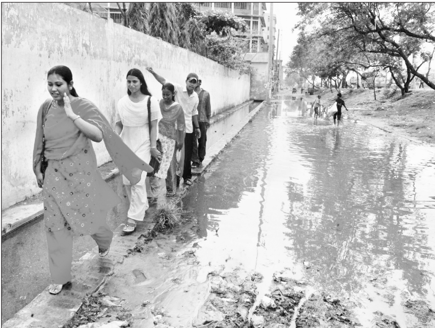
The road in front of Dania University College at Jatrabari in the city goes under water even after a little rain, causing suffering to students as well as pedestrians. The picture was taken yesterday.

The president also thanked the university authorities, guardians as well as the fellow faculty members for providing right directions and proper guidance to the students.