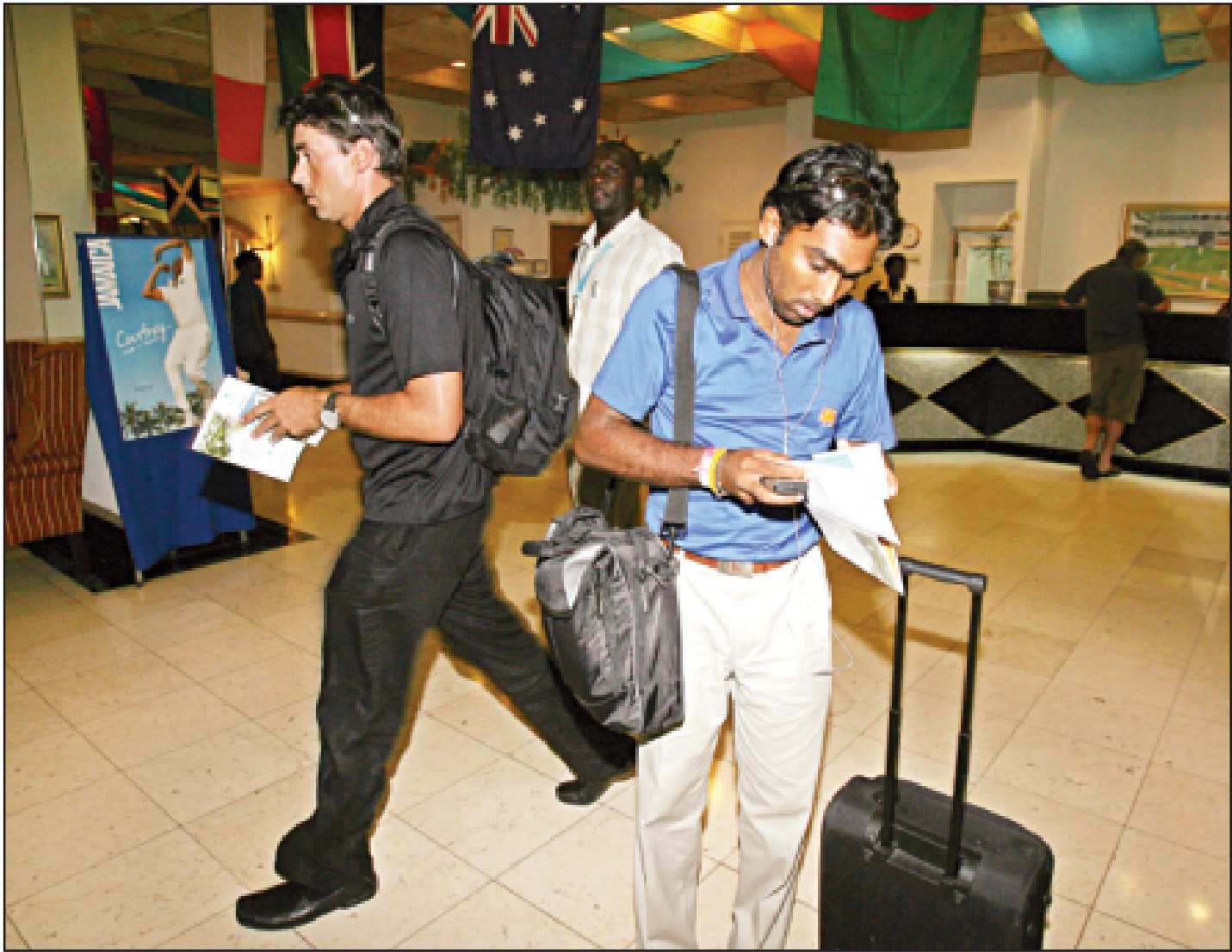
NOT EYE TO EYE: Sri Lanka captain Mahela Jayawardene (R) and New Zealand captain Stephen Fleming cross paths as they arrive at their team hotel in Kingston on Monday ahead of their World Cup semifinal clash at Sabina Park today.

Umpires: Rudi Koertzen and Simon Taufel.