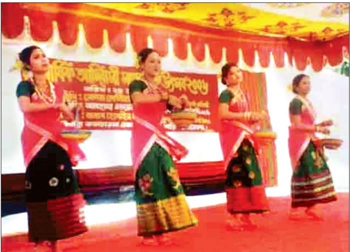
Dancers from ethnic communities perform at the academy

OUR CORRESPONDENT, Netrakona The aim of Birishiri Upojatiyo Cultural Academy in Netrakona is to preserve and promote the traditions and cultures of the ethnic groups in greater Mymensingh region. Birishiri is a small rural area near Durgapur upazila headquarters. It is a centre for cultural, religious and educational activities of the Garo and Hajong people.