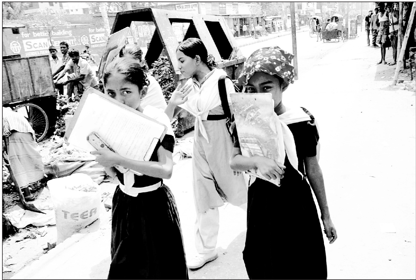
Schoolgirls try to avoid inhaling the stinking air from garbage left on Mirpur Mazar Road in the city. The picture was taken yesterday.