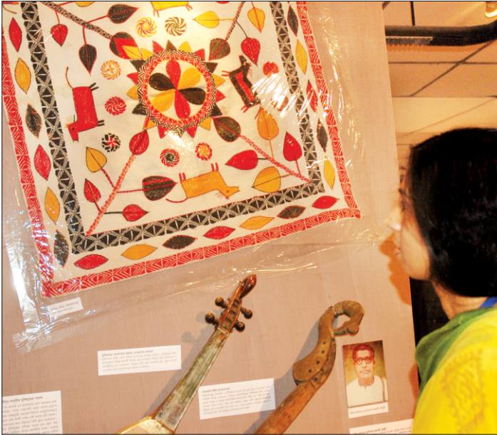
A nakshikantha on display at the exhibition

Saidur's collection that includes nakshikantha , Lokkhir shora , haath-pakha , tepa dolls, terracotta figurines, dice and cutters used for peetha making and more can be a treasure-trove for the nation.