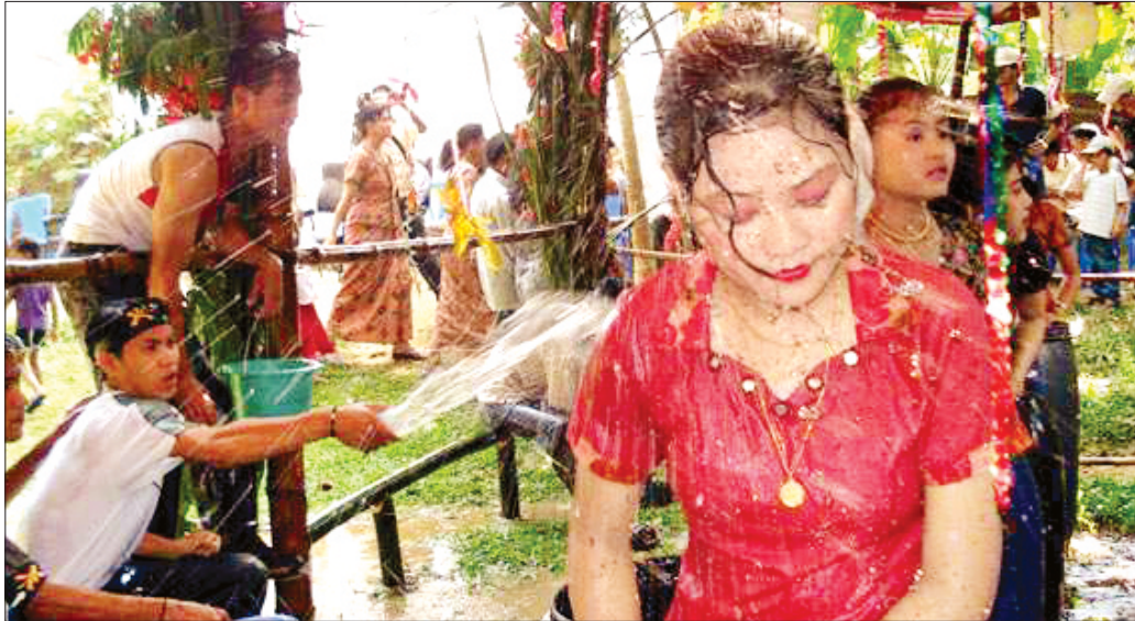
Rakhain girls and boys splash water on one another at the festival