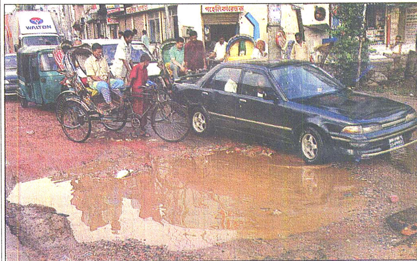
Potholes on Gulshan-Badda link road have been causing suffering to passengers as well as pedestrians, but the authorities remain indifferent. This picture was taken yesterday.