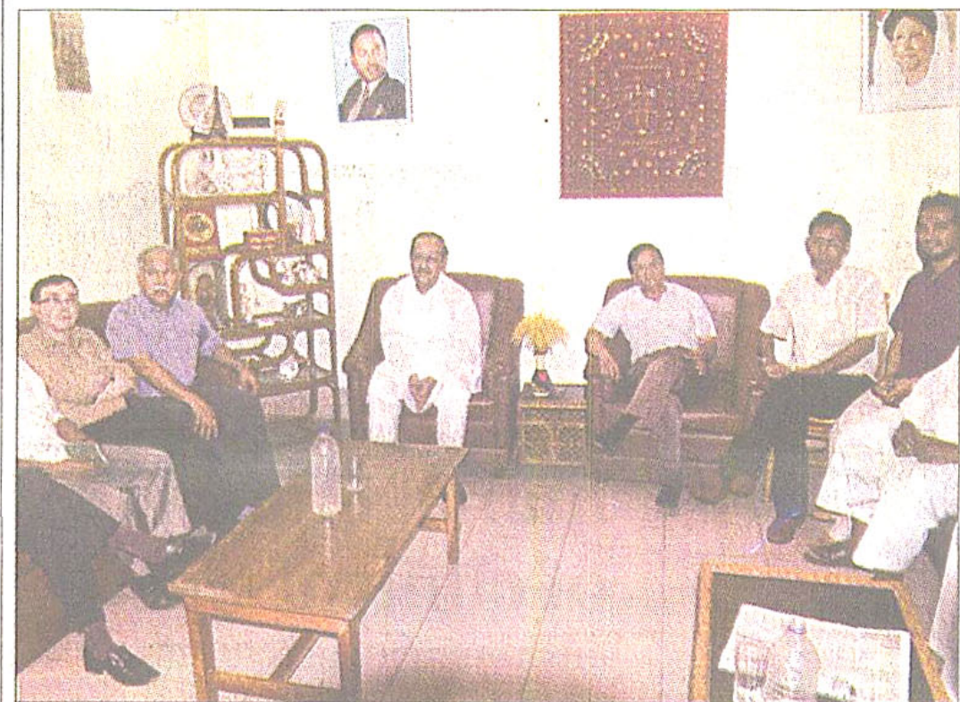
Several key leaders of BNP meet the party's Secretary General Abdul Mannan Bhuiyan, at his residence in the capital yesterday.

بِسْمِ اللَّهِ الرَّحْمَنِ الرَّحِيمِ Bismillahir Rahmanir Rahim