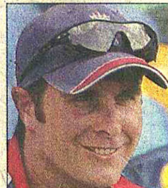
Michael Vaughan (England cricket captain) "I won't be retiring from one-day cricket. I am not stupid."