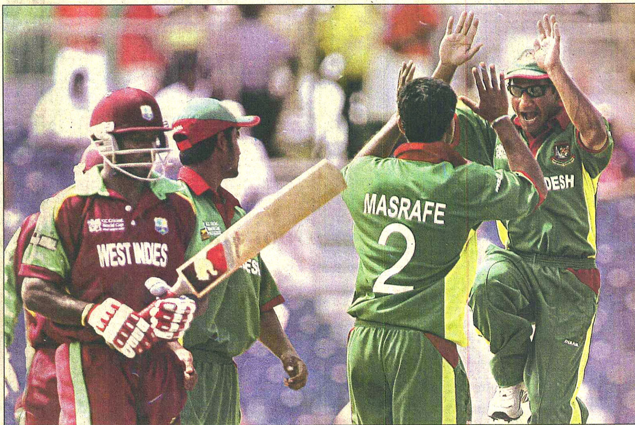
Bangladesh pace spearhead Mashrafe Bin Mortaza celebrates his wicket of West Indies opener Devon Smith (L) with an excited captain Habibul Bashar during their World Cup Super Eights match at the Kensington Oval in Bridgetown on Thursday.