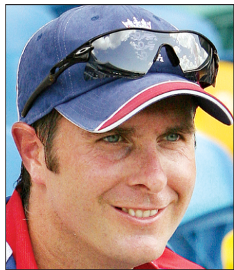
Michael Vaughan (England cricket captain) "I won't be retiring from one-day cricket. I am not stupid."