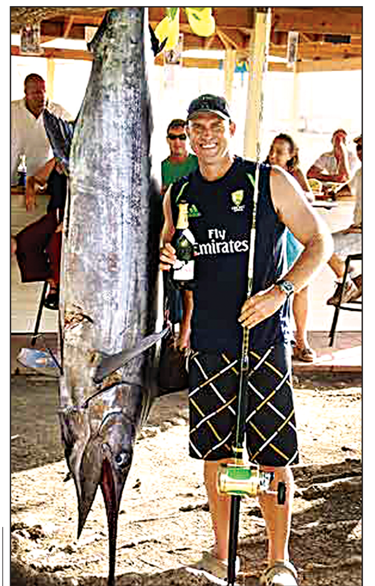
Australia player Matthew Hayden displays a 135kg marlin he caught off the Grenada coast on a fishing trip with teammates on Tuesday.