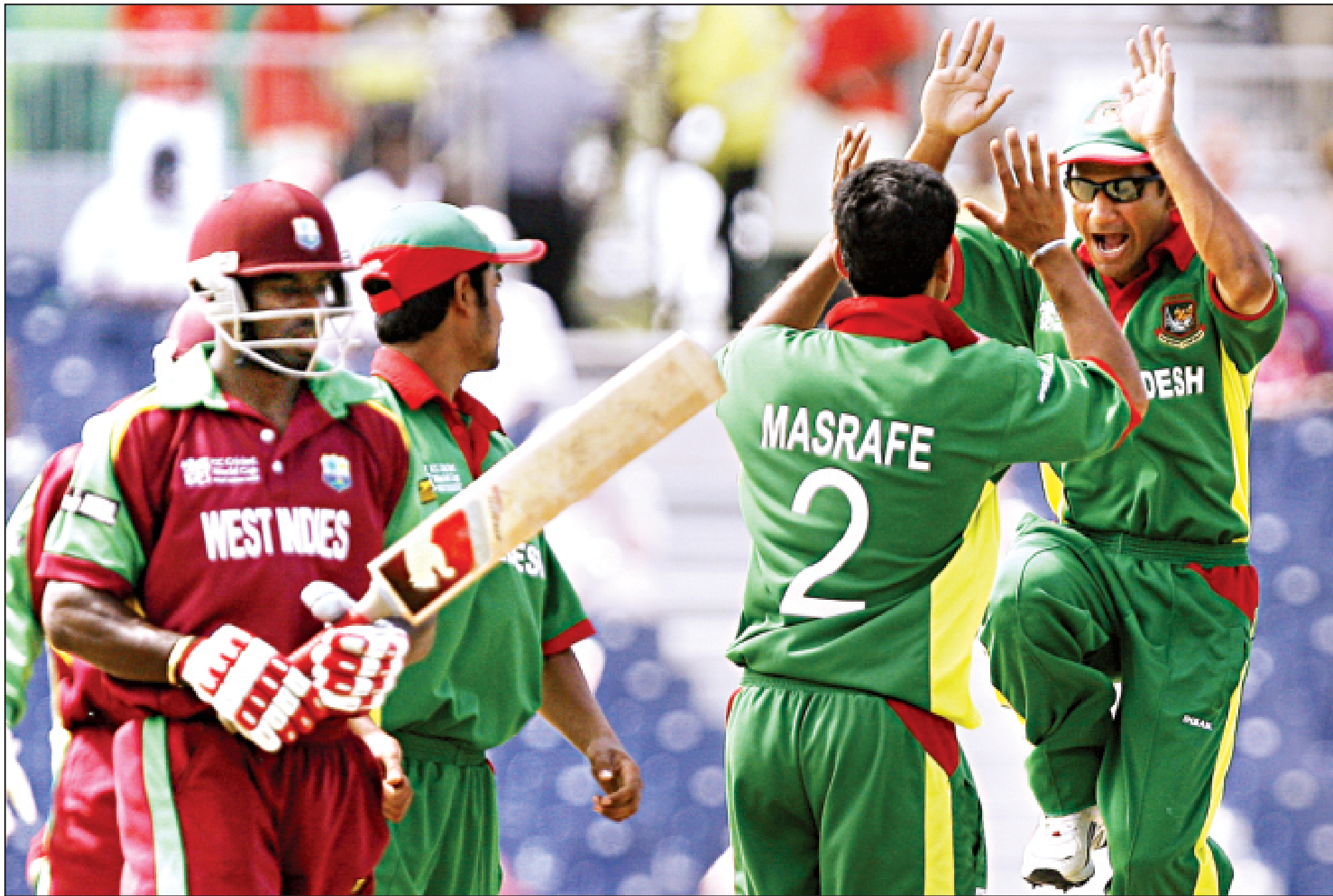
Bangladesh pace spearhead Mashrafe Bin Mortaza celebrates his wicket of West Indies opener Devon Smith (L) with an excited captain Habibul Bashar during their World Cup Super Eights match at the Kensington Oval in Bridgetown on Thursday.