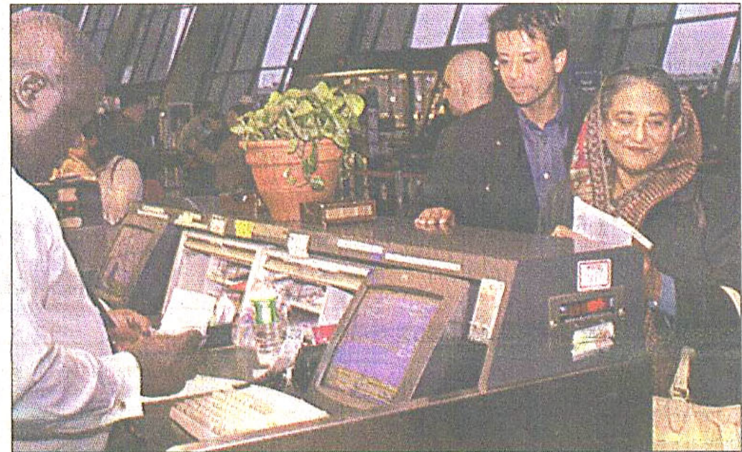
Awami League President Sheikh Hasina and her son Sajeeb Wajed Joy at Dulles Airport in Washington DC. Hasina left the United States for London yesterday morning Bangladesh time.