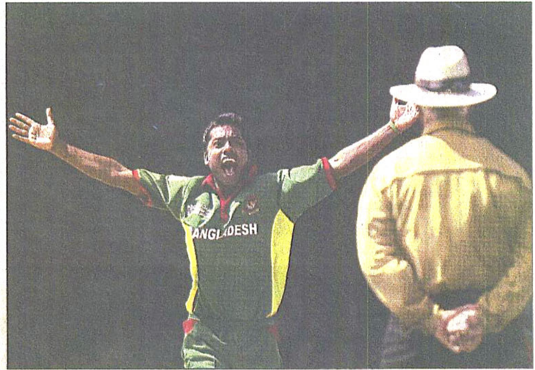
Bangladesh paceman Syed Rasel (L) successfully appeals for an lbw decision against West Indies opener Chris Gayle (not in picture) during the World Cup Super Eight match at the Kensington Oval in Bridgetown yesterday.