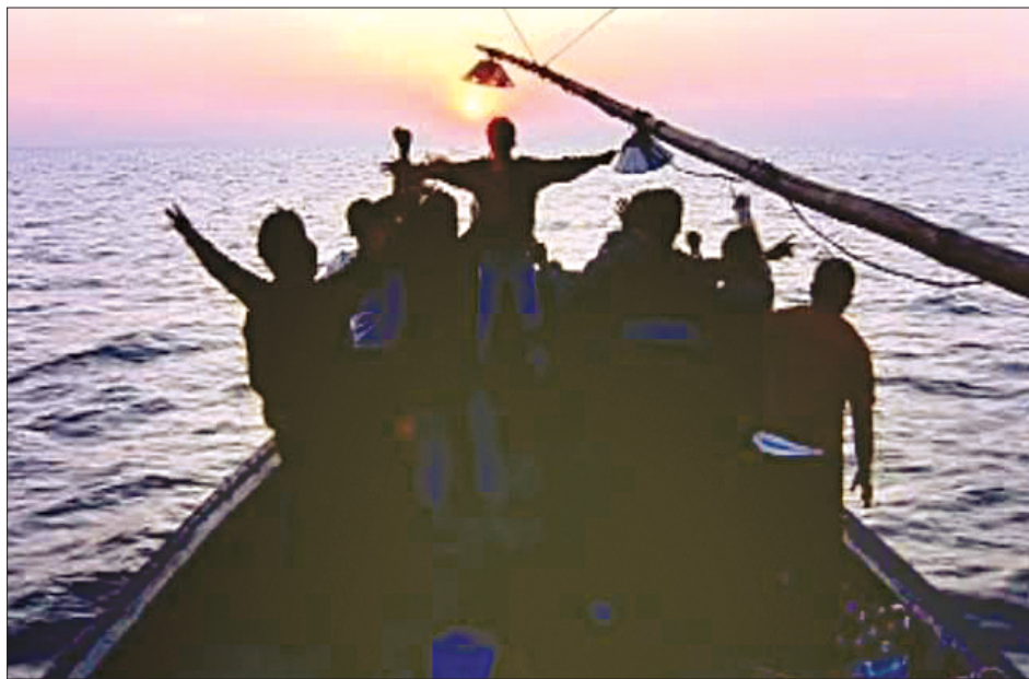
A scene from the tele-film

Everyday millions around the world are falling prey to illegal traffickers. Out of desperation, seeking a better life, people often adopt irregular and unsafe routes of migration. Dik Bhranto