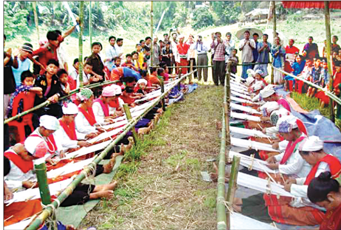
Tangchangyas celebrate Boisabi

The sports competition was followed by a colourful cultural programme. Artists of the Tangchangya community per-