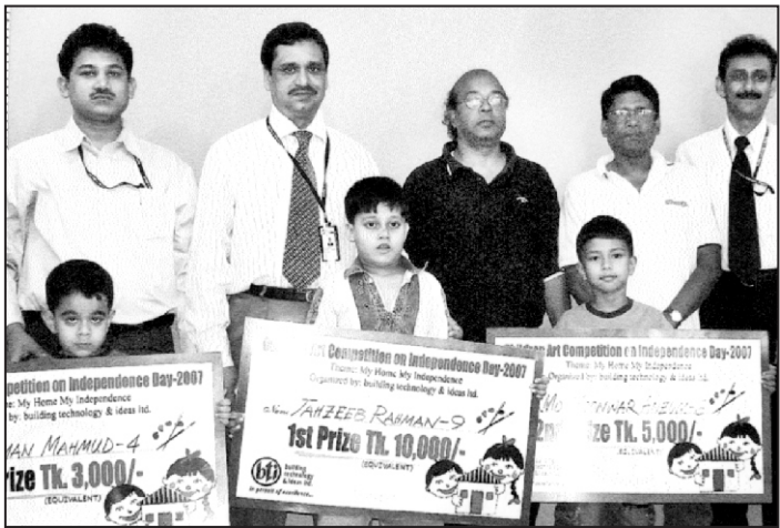
Building Technology and Ideas Ltd (BTI) officials pose for photograph with the winners of Children's Art Competition at the prize giving ceremony at its corporate office at Pallabi in the city recently. The company organised the competition marking the Independence Day.